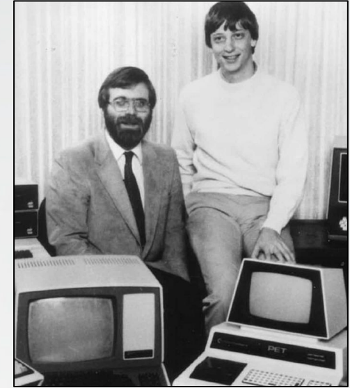
Paul Allen & Bill Gates