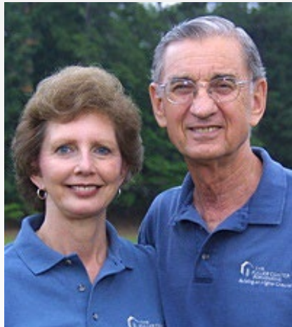
Millard & Linda Fuller